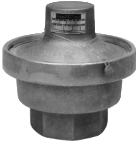
FIGURE 50 SERIES SAFETY VALVE